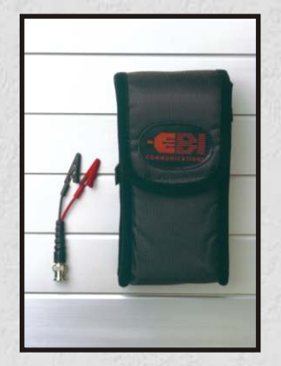
Complete with toolbelt holster and croc clip adaptor

* Measurement accuracy of +/-1% assumes the instrument setting for velocity of propagation (Vp) of the cable under test to be accurately set, homogeneity of the Vp along the cable length, and accurate cursor positioning.