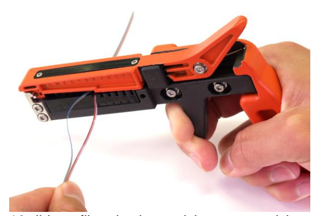
12-ribbon fiber in the tool is separated into two potions.