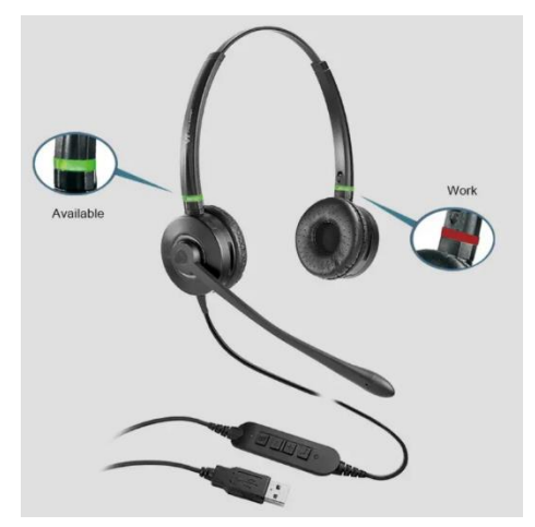
different type connector version 2.5/3.5mm/PLT-QD/USB/J-QD