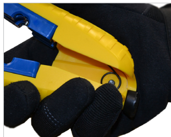
Low profile hinge & surface grip comfortably fit in hand for increased leverage & reduced fatigue.