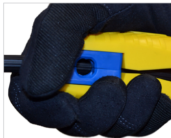
Long-lasting steel blade performs up to 5,000 cuts without dulling or reducing performance.