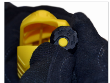
Recessed blade design & stowage lock provides safety & protects the blades while closed.

For more information or to locate the nearest authorized Ripley® distributor, please visit www.ripley-tools.com or call 1 (800) 528-8665 to speak to a customer service representative.