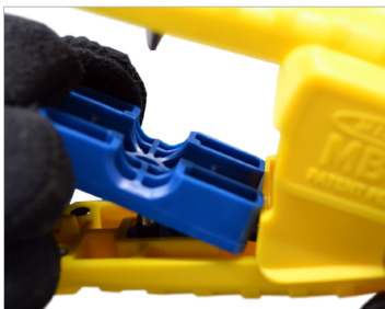
Magnetic trays accurately determine the appropriate blade depth & cable diameter to prevent damage.