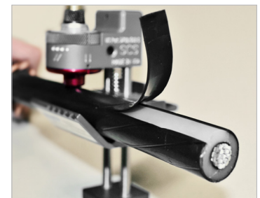
Simply pull the tool along the full cable length to perform longitudinal cuts.