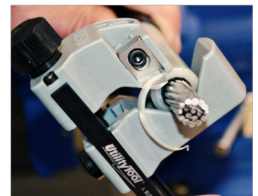
Unique, low-friction V-jaw provides precise & accurate clamping.