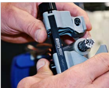
Easily adjusts to support cable with diameters from 0.55" to 2.36".