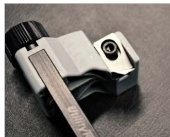
Recessed blade assures safety & is easily replaced.