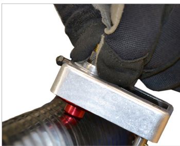
Blade depth is easily adjustable & set by turning the dial.