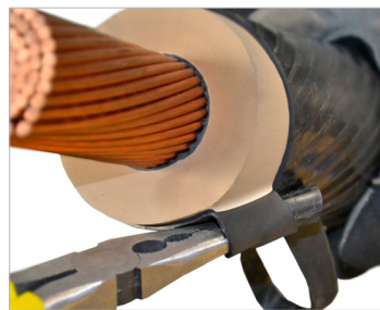
Score semi-con in a spiral pattern for a continuous chip.