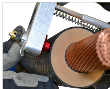
Easily clamp onto the cable width, adjusting for various cable sizes.