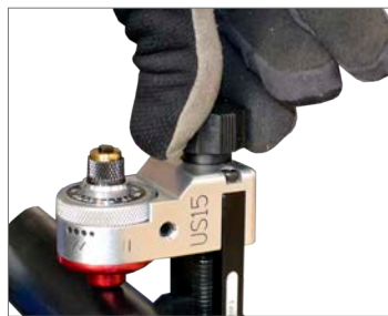
Knobs are engineered with knurls & grooves for easy adjustment when wearing gloves