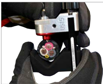
Quick-adjust jaw accepts hard & soft insulated cables ranging from 0.39" to 2.36" (10 mm to 60 mm).