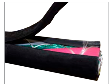
Quickly & easily performs ring, spiral & longitudinal cuts.