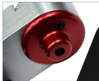
Recessed steel blade makes tool safe to carry & store.