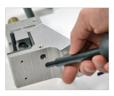
Detachable, ergonomic handles for use in tight spaces.