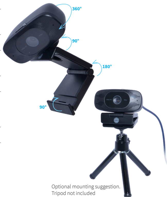
Optional mounting suggestion. Tripod not included