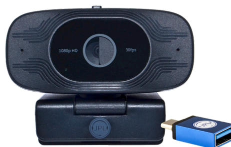
USB-A to USB-C adapter included